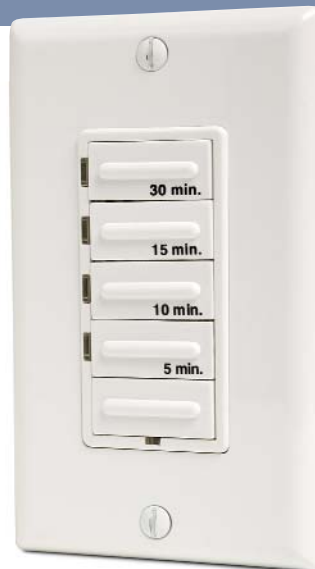
Leviton's timer switch shuts off automatically after a specified amount of time has elapsed.