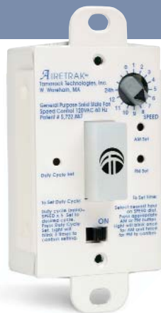
Programmable switches like Tamarack's Airetrak can be used to ventilate a whole house.

A variety of switches allows fans to run longer, or to cycle on and off automatically as they are needed.