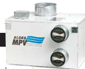
Sensors ensure that each port in this unit operates at its rated cfm.

Energy Federation Inc. 800-379-4121 www.efi.org Fantech 800-747-1762 www.fantech.net Leviton 800-824-3005 www.leviton.com