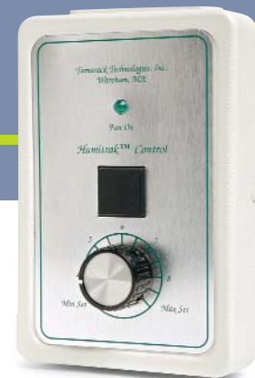
When the relative humidity reaches a preset level, this Tamarack Humitrak activates the fan.

The simplest type is an electronic or mechanical timer programmed to keep the fan running for a set amount of time. Leviton's version lets you select the running time with the push of a button. A variation is Energy Federation's delay-off switch, which keeps the fan on after the switch is turned off. An adjustment screw behind the cover plate allows users to set the extended run time.